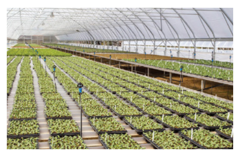
Hope Valley Nursery - Western Australia