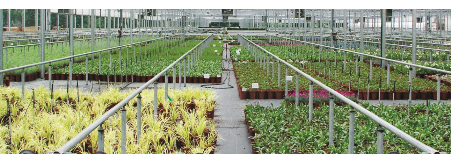
Different crops controlled by an Argus system