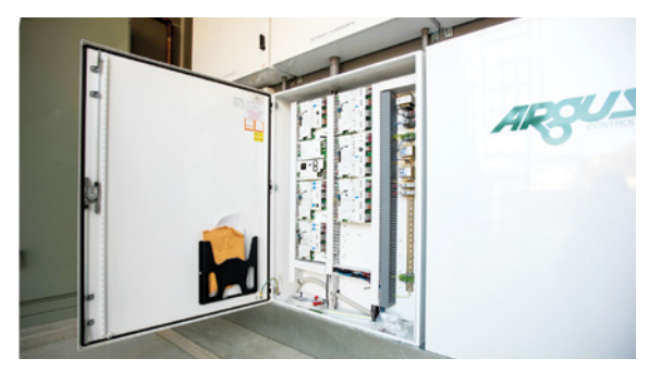
Argus Panels - CSIRO

Argus can provide custom engineered combination panels containing the Argus Titan control hardware along with prewired power distribution and line voltage relays matched to the controlled loads. This allows for a space saving, 'all-in-one' design and minimizes on-site installation.