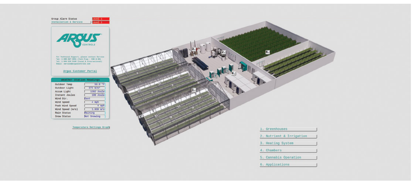
Fully customizable screens on the Titan 900 software for a detailed view of your facility

The Titan 900 software offers an enhanced user experience with innovative visual controls and value added features (such as intuitive visual controls, enhanced graphs, API, and smart reporting). The refreshed user interface uses colour and layout strategies that can be customized to suit individuals' need for style and information. Our software is designed to de-clutter the interface, optimize visualization of your facility's data, and focus your attention on what is important to you.