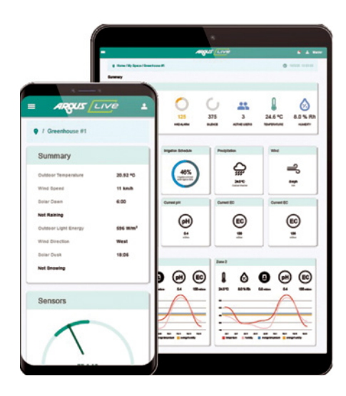
Argus Live can be used on tablets, phones, and PC

With a live view of your operation, you can monitor, analyze, and run your facility in real time, giving you full control whether you're at your desk or on the move. It is a safe, secure, and powerful enhancement to one of the most advanced environmental control systems on the market.