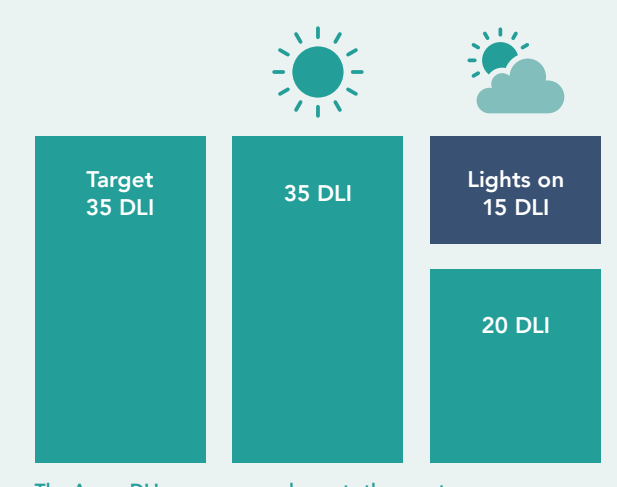
The Argus DLI program supplements the exact amount of artificial light required